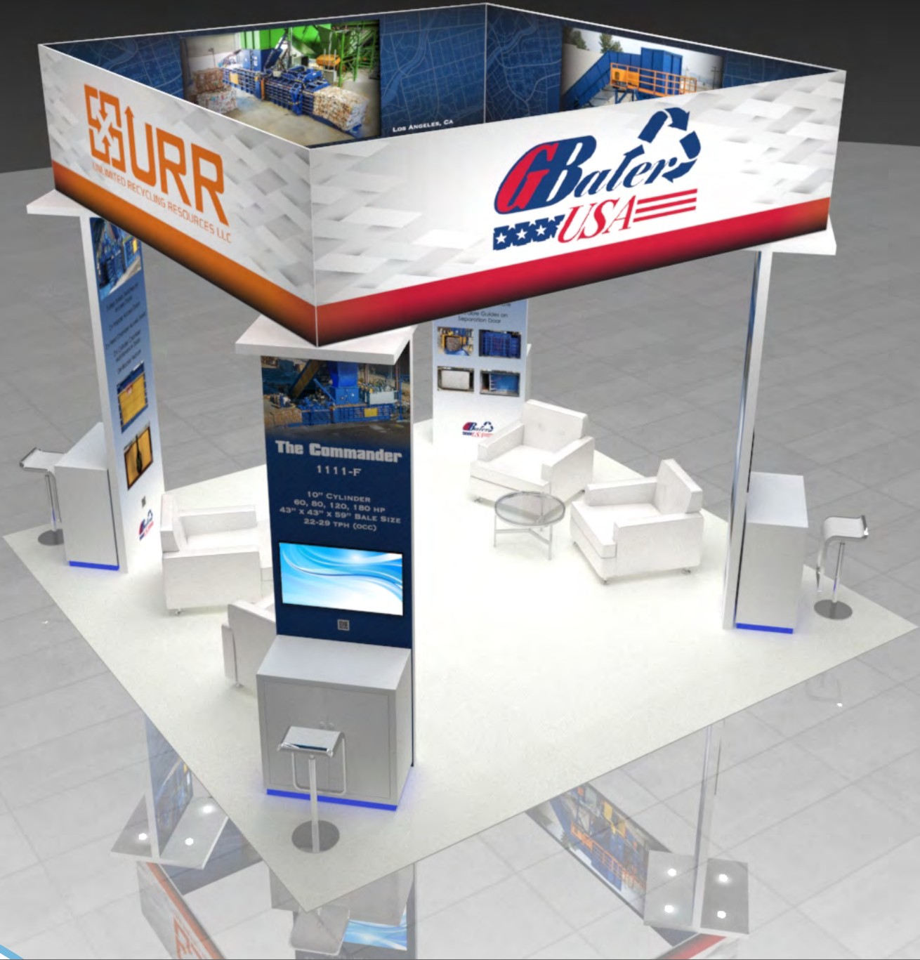
Shot #: 3 Perspective