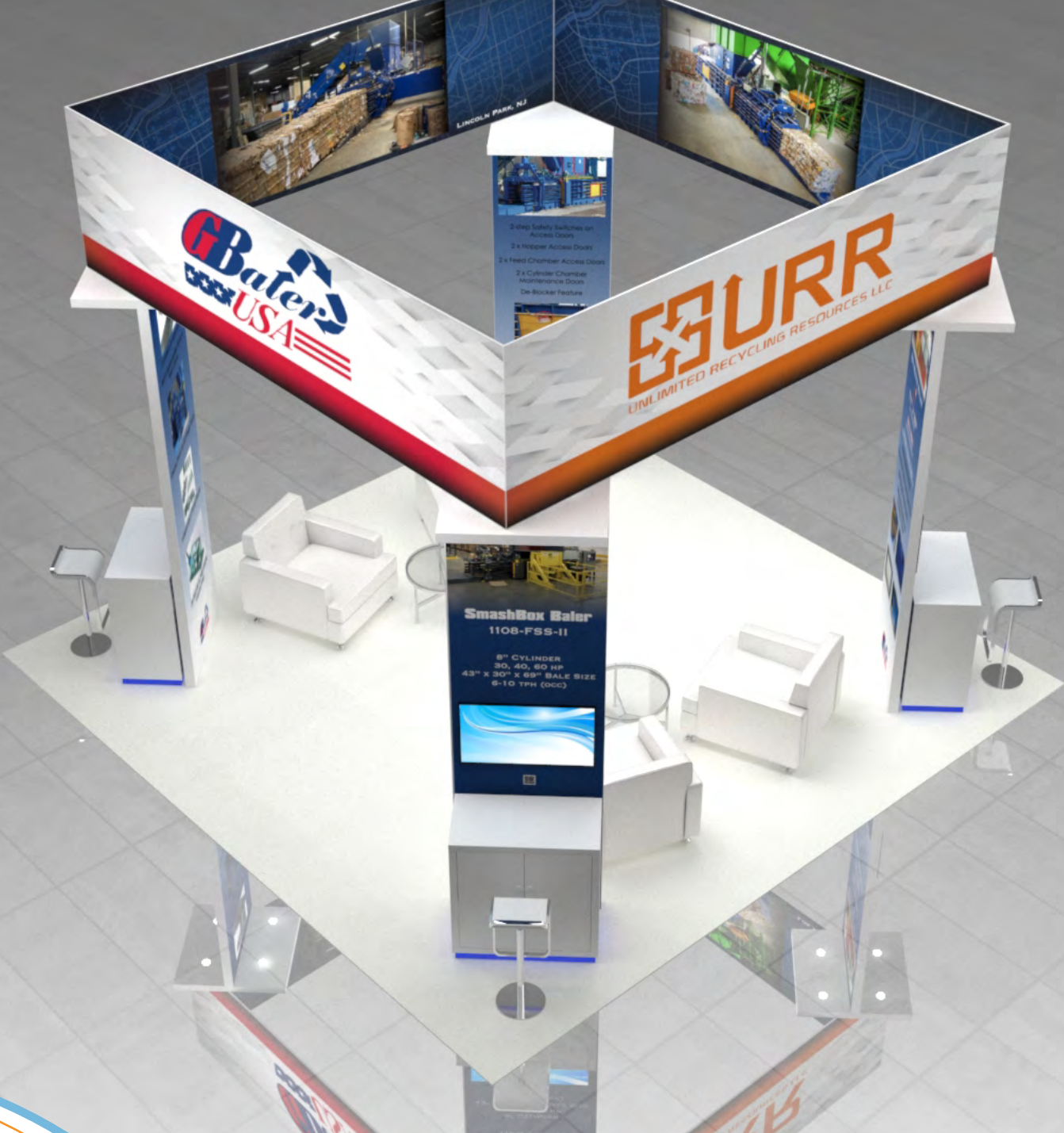
Shot #: 6 Ortho