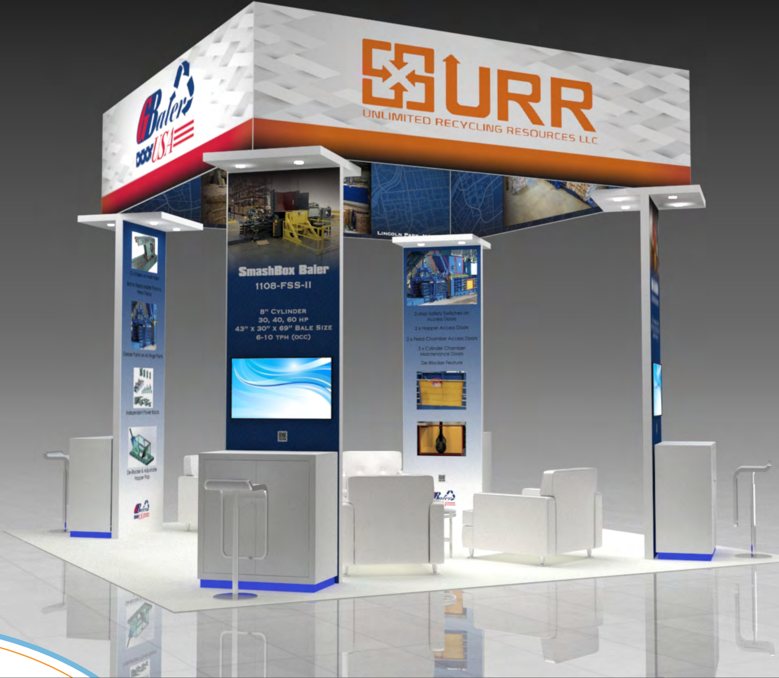
Shot #: 4 Ortho