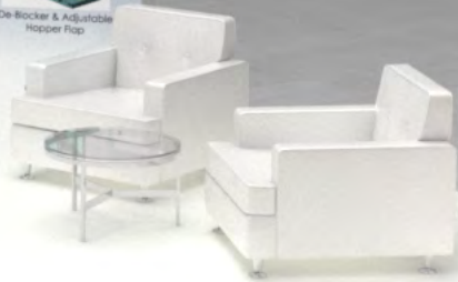
Shot #: 1 Perspective

12 x Rollers on each Ram Built-in Replaceable Floors & Wear Tracks Grease Points on All Hinge Points Independent Power Blocks De Blocker & Adjustable Hopper Flap